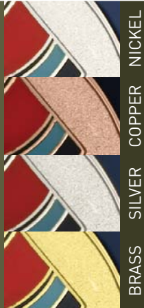
NICKEL COPPER SILVER BRASS