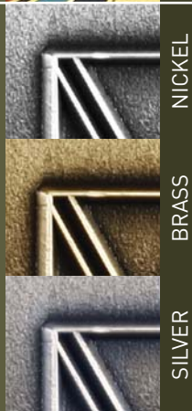
NICKEL BRASS SILVER