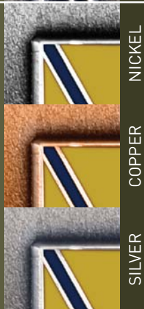
NICKEL COPPER SILVER