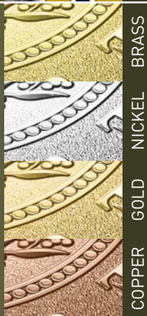
BRASS NICKEL GOLD COPPER